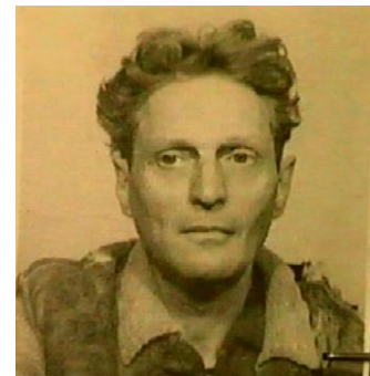
Mug shot of Late Reverend Richard Wurmbrand when held in Jilava.