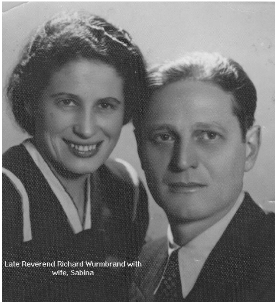
Late Reverend Richard Wurmbbrand with wife, Sabina

Email: hfr@helpforrefugees.com ; Website: http://helpforrefugees.com