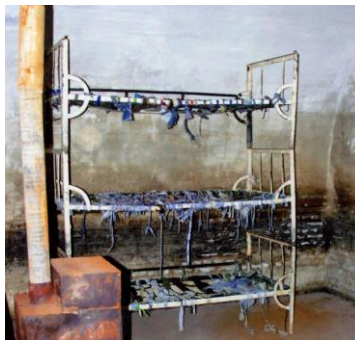
Prison cell with bunk-beds with no mattress, prisoners were obliged to sleep on. Stove for show only, never heated in cold winters.